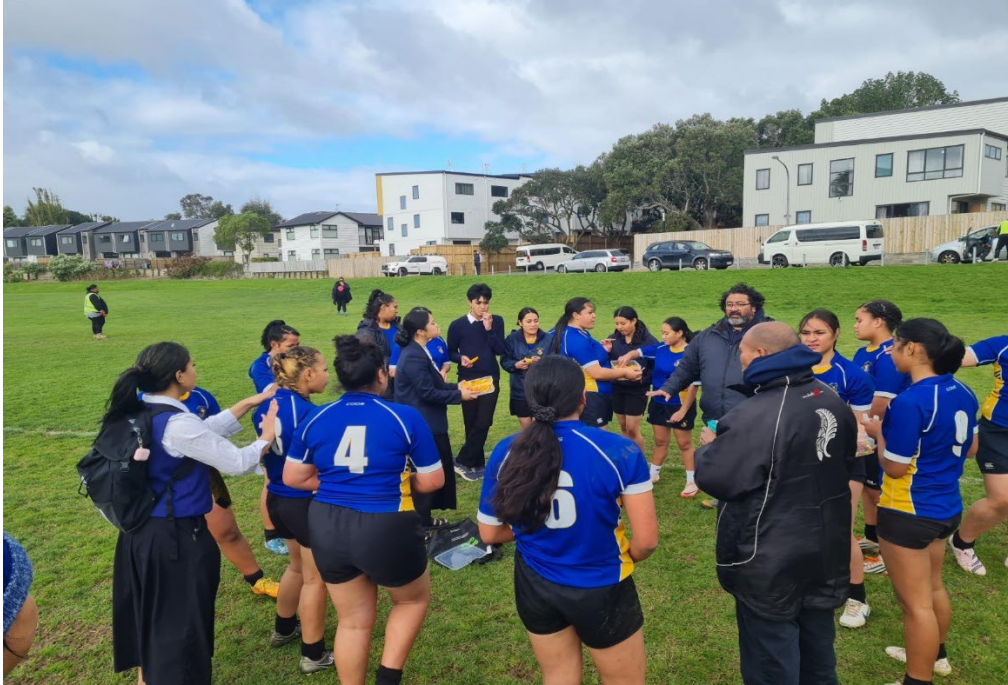
Winter Sports photo Friday 23 rd August in the school gym.

Our Rugby 10s Girls played their semifinals against One Tree Hill on Monday. The game was very intense, and One Tree Hill was a great team who gave our girls a good run. Our girls kept fighting and held on to come away with the win 22-19. The girls will play the finals on Monday against Onehunga.